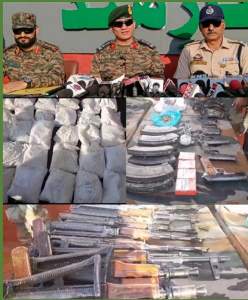
Army personnel display arms and drugs recovered after foiling an infiltration bid in Kupwara

On 23 June 2023, Jammu and Kashmir's police announced that four terrorists were neutralised in Kala Jungle of Machhal sector, Kupwara. This victory was the result of a joint operation by Indian armed forces and police.