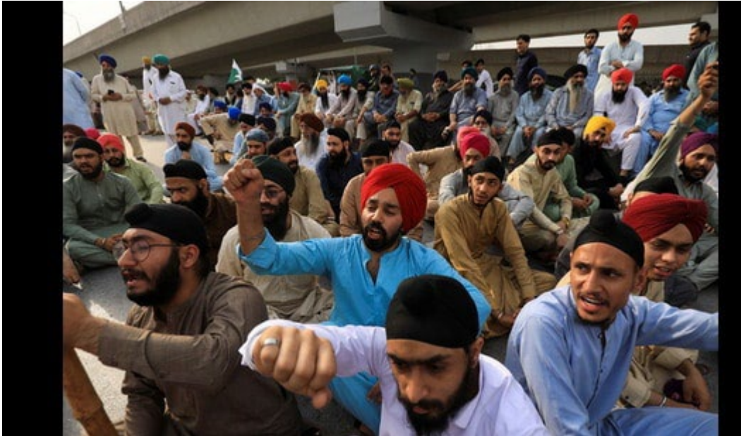
Members of the Pakistan's Sikh community protest after two Sikh men were killed by gunmen, in Peshawar, Pakistan.

4 KILLED IN 3 MONTHS, ISIS CLAIMS RESPONSIBILITY FOR 2 ATTACKS