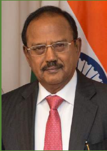
National Security Adviser (NSA) Shri Ajit Doval

In a strong pitch for the need to ensure peace and stability in Afghanistan, National Security Adviser Ajit Doval called for combating terrorism emanating from the region.