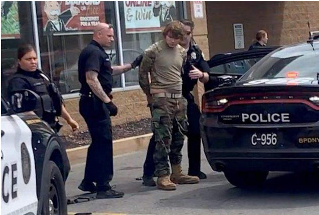
A picture grab from Facebook shows police apprehending suspected teenage shooter

ATTACK REPORTEDLY INSPIRED BY FAR-RIGHT CONSPIRACY THEORY