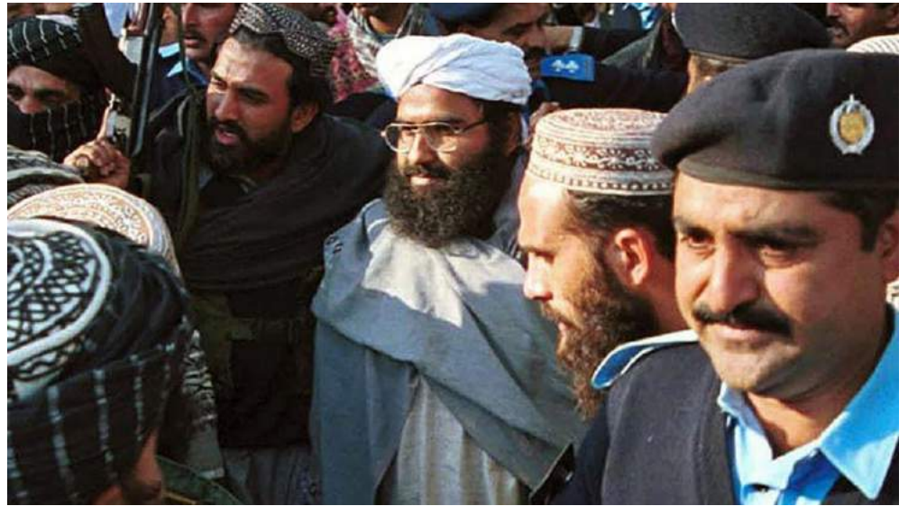
File pic of Jaish-e-Mohammed head Masood Azhar with Pakistan security forces and militants

27-PAGE REPORT SAYS AQIS, JeM, LeT HAVE TRAINING CAMPS IN AFGHANISTAN