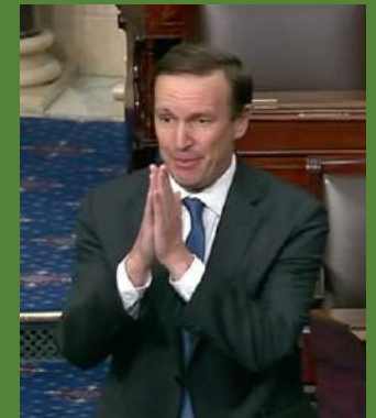
Sen. Chris Murphy pleading for gun control reforms in the US Senate

REPUBLICANS BLOCK BILL ON DOMESTIC TERRORISM, GUN REFORMS